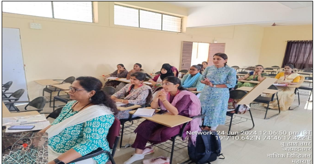
Participating Professors For the Workshop Asked Questions