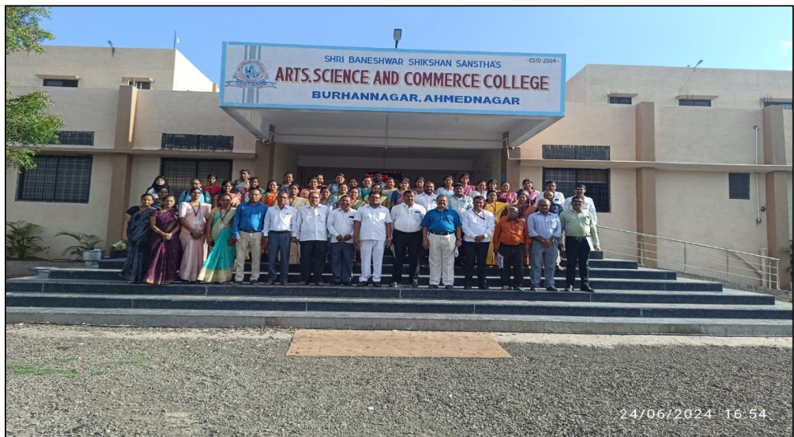
Regarding All Faculty and Administrative Staff Present for The Workshop.