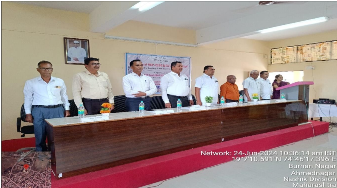
Dignitaries During the Varsity Song Presentation at the Beginning of the Workshop.