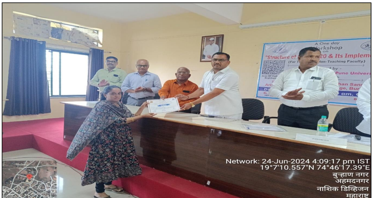
Hon. Principal While Distributing the Certificate At the Conclusion of the Workshop.