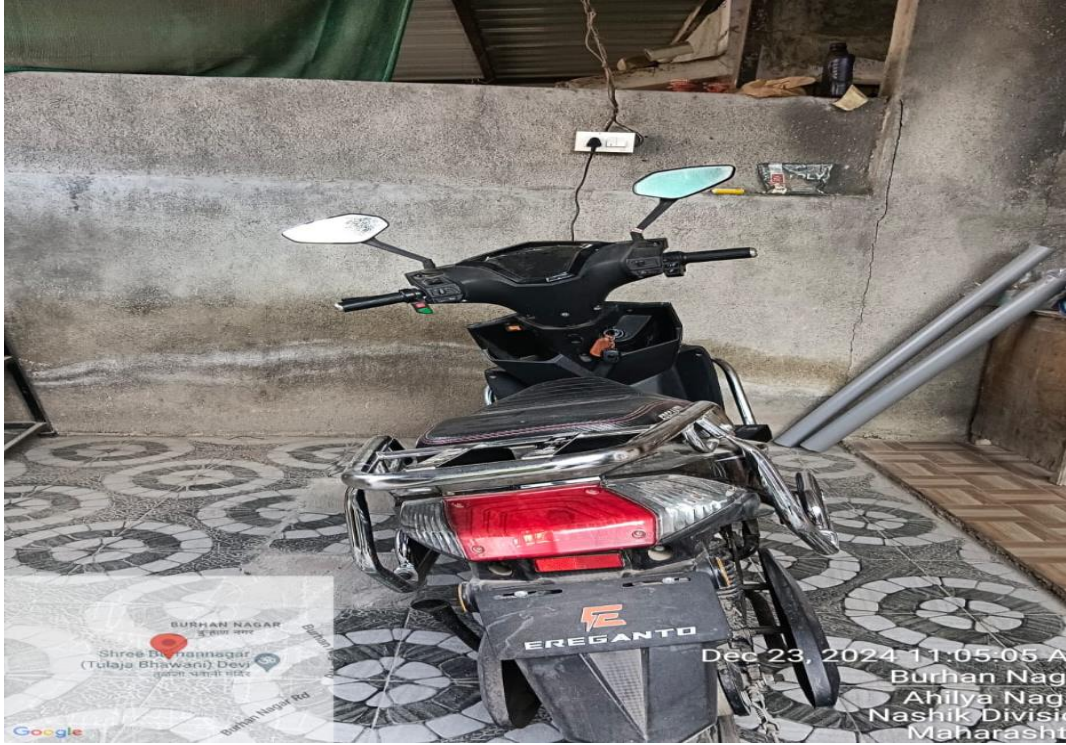
Battery powerd vehicles