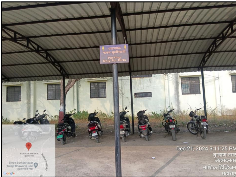
Parking for Girl