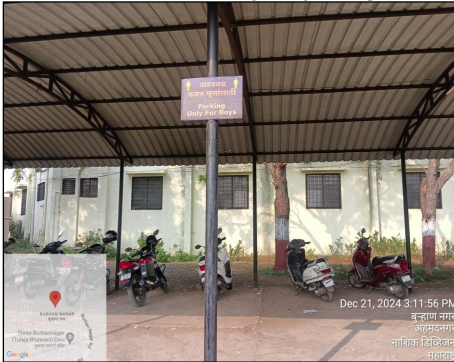
Parking for boys